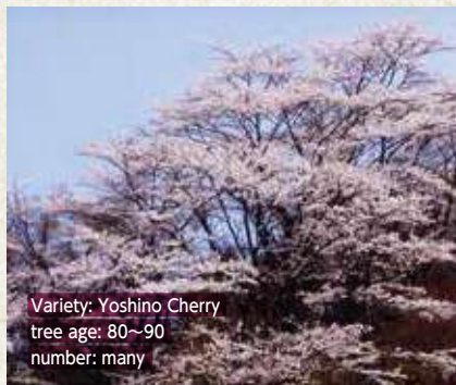
Variety: Yoshino Cherry tree age: 80-90 number: many

Access: bus stop "before the Tukui-Kankou center" gets off. Address: 162, Negoya, Midori-ku Sagamihara-shi TUKUI TOURISM ASSOCIATION Tel:042-784-6473