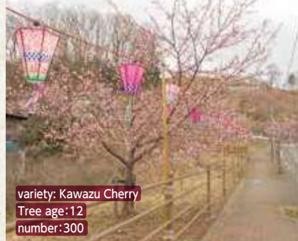
variety:Kawazu Cherry Tree age:12 number:300

Access: bus stop "Before the Pleasure Forest" get off. Address: 1634, Wakayanagi, Midori-ku Sagamihara-shi Resort of the Lake Sagami Pleasure Forest Tel:042-685-1111