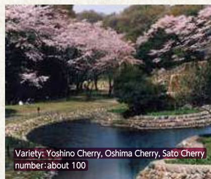
Variety: Yoshino Cherry, Oshima Cherry, Sato Cherry number:about 100

Access: On foot-from Odakyu Sagamio-ono Station 10 minutes. Address: 2-1-1, Bunkyo, Minami-ku Sagamihara-shi Sagami Women's University Tel:042-742-1411