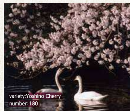
variety:Yoshino Cherry number: 180

Access: On foot-from JR Kamimizo Station 7 minutes. Address: 5-11-50, Yokoyama, Chuo-ku Sagamihara-shi Yokoyama park Tel:042-758-0886