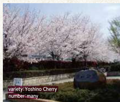
variety:Yoshino Cherry number:many

Access: ①bus stop "Shiyakusyo-mae" gets off. ②On foot-from JR Sagamihara Station 15 minutes. Address: 2, Chuo, Chuo-ku Sagamihara-shi SAGAMIHARA TOURISM ASSOCIATION Tel:042-771-3767