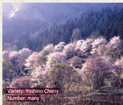
Variety: Yoshino Cherry Number: many

Access: bus stop "before the Sagamiko-Rinkan park" gets off -- on foot 2 minutes. Address: 1432, Wakayanagi, Midori-ku Sagamihara-shi SAGAMIKO TOURISM ASSOCIATION Tel:042-684-2633