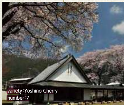
variety:Yoshino Cherry number:7

Access: bus stop "Oku-Sagamiko" gets off -- on foot 3 minutes. Address: 807-2, Aone, Midori-ku Sagamihara-shi Aone Midori-no Kyuka-Mura Tel:042-787-2215