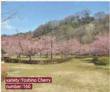
variety:Yoshino Cherry number:160

Access:bus stop "Ohto" gets off -- on foot 25 minutes. Address: Kawajiri, Midori-ku Sagamihara-shi SHIROYAMA TOURISM ASSOCIATION Tel:042-783-8065