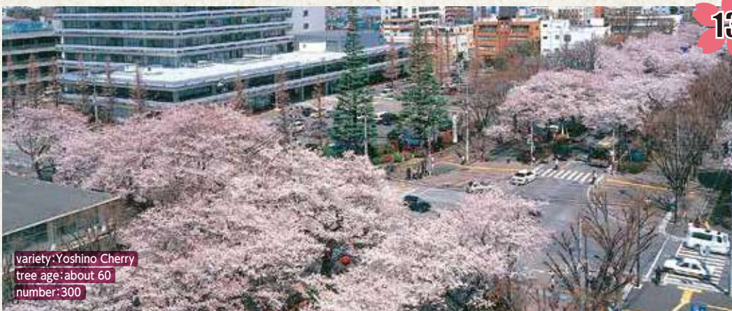
variety:Yoshino Cherry tree age:about 60 number:300

Access: bus stop "Suigo-Tana" gets off -- on foot 7 minutes. Address: Suigotana, Chuo-ku Sagamihara-shi SAGAMIHARA TOURISM ASSOCIATION Tel:042-771-3767