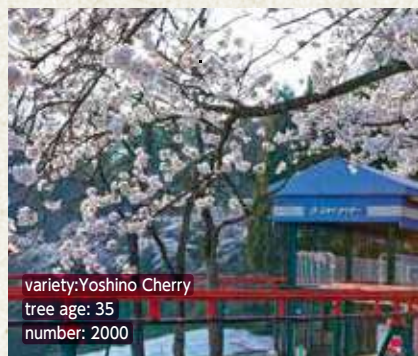
variety:Yoshino Cherry tree age: 35 number: 2000

Access: bus stop "Mukaibara" gets off -- on foot 2 minutes. Address: 3967, Nagura, Midori-ku Sagamihara-shi HUIJINO TOURISM ASSOCIATION Tel:042-687-5581