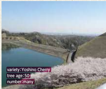
variety:Yoshino Cherry tree age:50 number:many

Access: bus stop "Shimo-Inou" gets off. Address: Nagatake, Midori-ku Sagamihara-shi TUKUI TOURISM ASSOCIATION Tel:042-784-6473