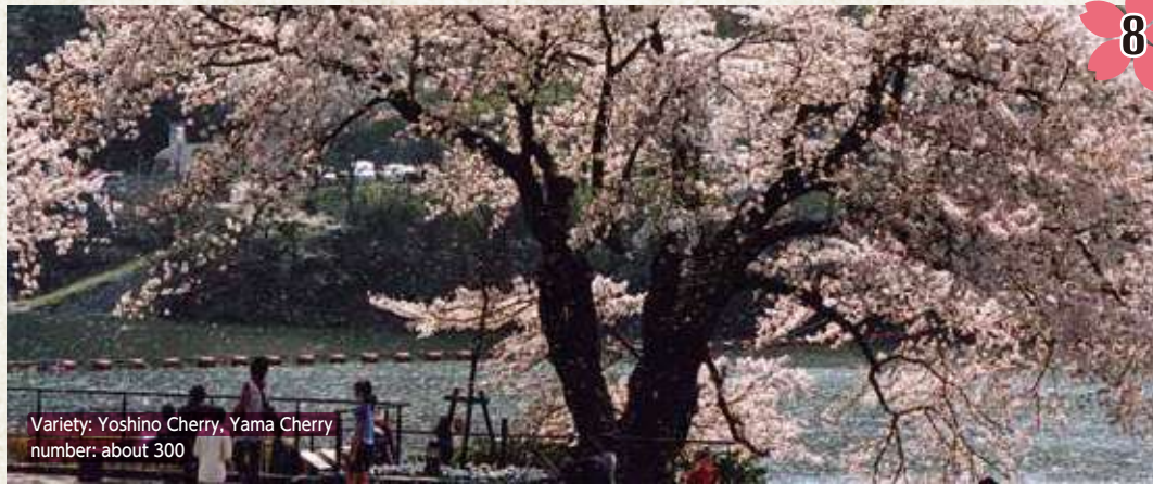
Variety: Yoshino Cherry, Yama Cherry number: about 300