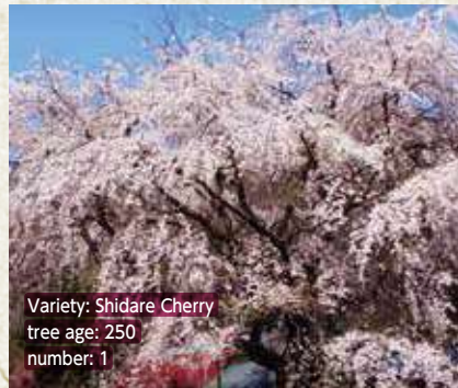
Variety: Shidare Cherry tree age: 250 number: 1

Access: bus stop "Narai" gets off -- on foot 15 minutes. Address: 691, Matano, Midori-ku Sagamihara-shi Ozaki Gakudo Hall Tel:042-784-0660