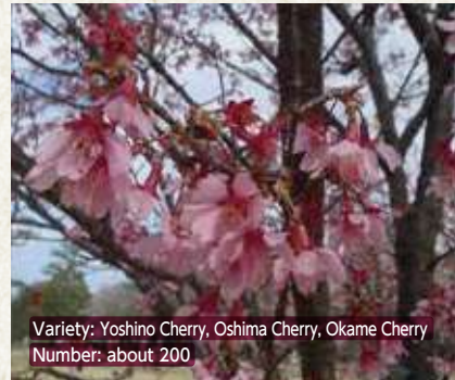
Variety: Yoshino Cherry, Oshima Cherry, Okame Cherry Number: about 200

Access: On foot-from JR Harataima Station 15 minutes. Address: 3277, Shimomizo, Minami-ku Sagamihara-shi ASAMIZO TOURISM ASSOCIATION Tel:042-778-2504