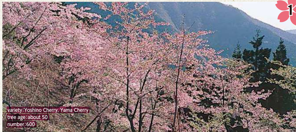
variety:Yoshino Cherry, Yama Cherry tree age:about 50 number:600