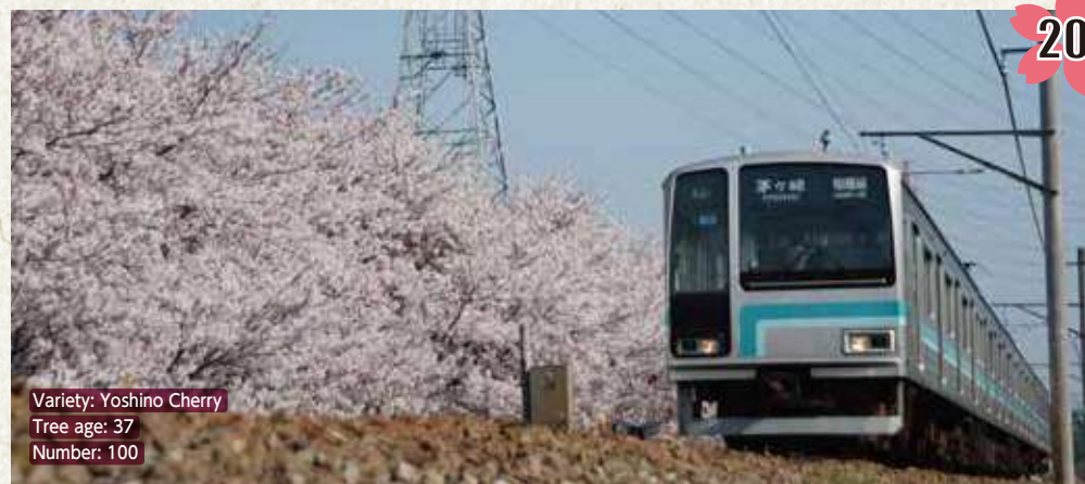
Variety: Yoshino Cherry Tree age: 37 Number: 100

Access: On foot-from JR Harataima Station 15 minutes. Address: Shimomizo, Minami-ku Sagamihara-shi ASAMIZO TOURISM ASSOCIATION Tel:042-778-2504