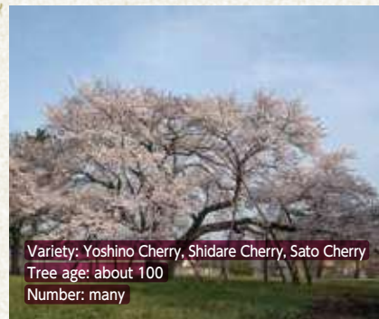
Variety: Yoshino Cherry, Shidare Cherry, Sato Cherry Tree age: about 100 Number: many

Access: On foot-from JR Huchinobe Station 3 minutes. Address: 2-15-1, Kanumadai, Chuo-ku Sagamihara-shi Kanuma park Tel:042-755-9781