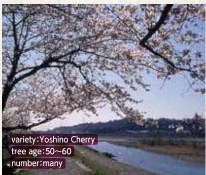
variety:Yoshino Cherry tree age:50-60 number:many

Access: bus stop "Sagamigawa-Shizen-no-mura" gets off -- on foot 5 minutes. Address: 3657, Oshima, Midori-ku Sagamihara-shi OSHIMA TUORISM ASSOCIATION Tel:042-760-6066