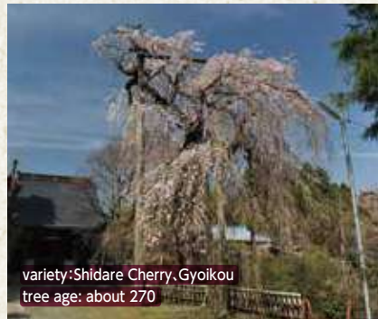
variety:Shidare Cherry, Gyoikou tree age: about 270

Access: bus stop "Kamazawa-Iriguchi" gets off -- on foot 130 minutes. Address: Sanogawa, Midori-ku Sagamihara-shi HUIJINO TOURISM ASSOCIATION Tel:042-687-5581