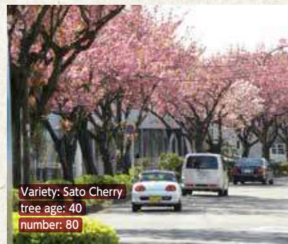
Variety: Sato Cherry tree age: 40 number: 80

Access: On foot-from JR Harataima Station 25 minutes. Address: 1889 / 2317, Asamizo, Minami-ku Sagamihara-shi Sagamihara park Tel:042-778-1653 / Sagamihara-Asamizo park Tel:042-777-3451